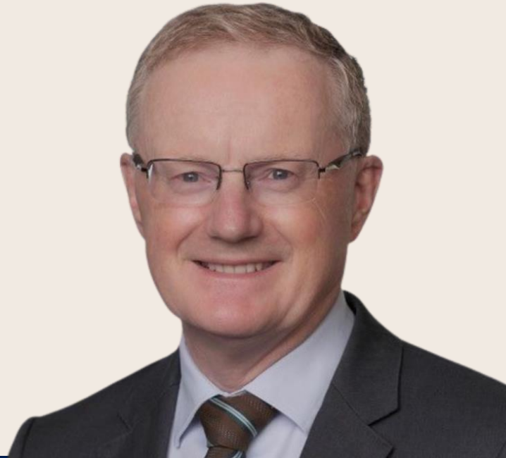
Dr Philip Lowe