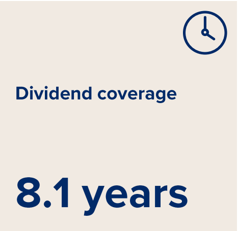
Fully franked dividends since inception (cents per share)